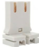
EHA-TOMB-23MM-SS 23mm non-shunted straight slot lampholders