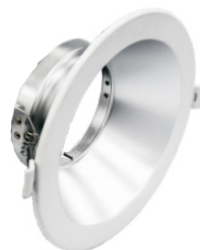
Trim Rings in 4", 6", and 8"