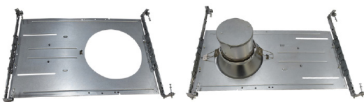
New Construction Plate