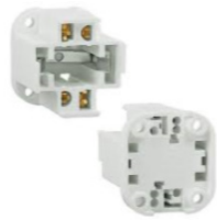
EHA-PL G24 Mount Base