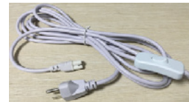
EHA-ONOFF-CABLE (6') Sold separately