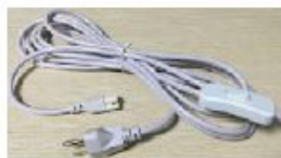
EHA-ONOFF-CABLE (6') Sold separately