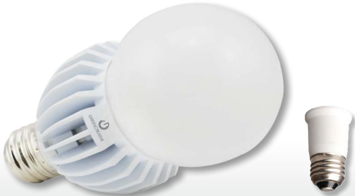
Optional Lamp Extender