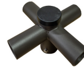
Misc Mounting Accessories